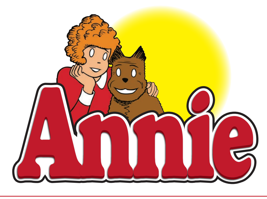
July 26-27, August 2-3, 9-10, 16-17; 2014 • 2:00 pm