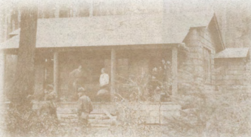
Kitsap Cabin – Circa 1922

Thanks to the generosity of people like you, we are nearing completion of Phase I of the restoration of Kitsap Cabin, which includes: