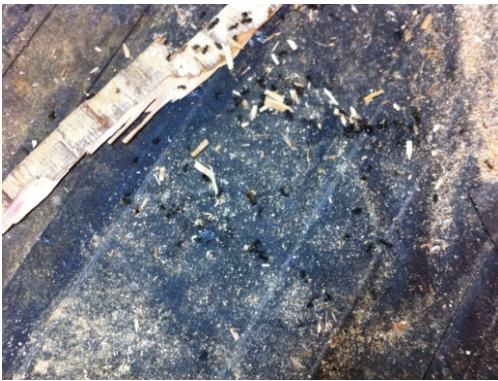
Swarming carpenter ants between floor layers