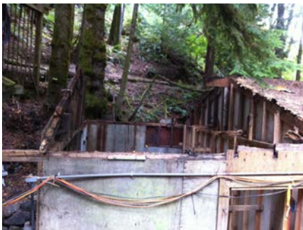
more rotten wood to be removed on wall