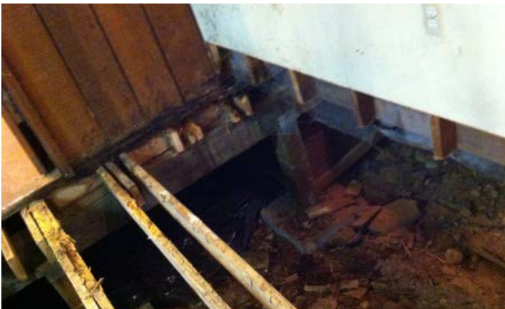
Cut-off pantry wall and removed water-damaged joists.

The pantry wall needed to be cut off a foot from the floor to remove water damaged wall board and 2"x4"s and some joists had to be cut out and replaced. It was a bigger job than originally anticipated!