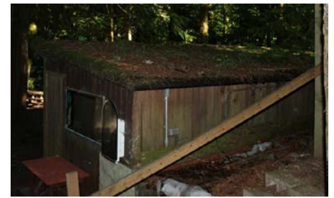
Old Harriet's Roof