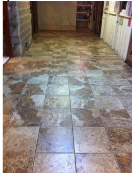
Finished Tile Floor!!!!