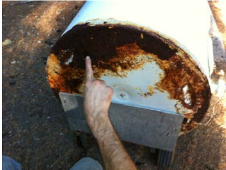
Rusted bottom of water heater

KITSAP CABIN FLOOR: As is typically the case, when you delve into a project, it can become more extensive than first imagined. Volunteers removed the main items from the kitchen and more experienced help was called in to deal with the floor removal.