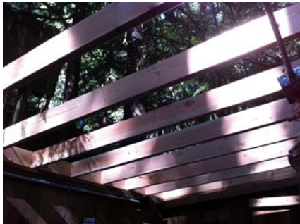
New roof structure for Harriets