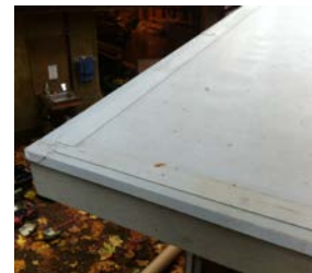
close-up of new TPO roof