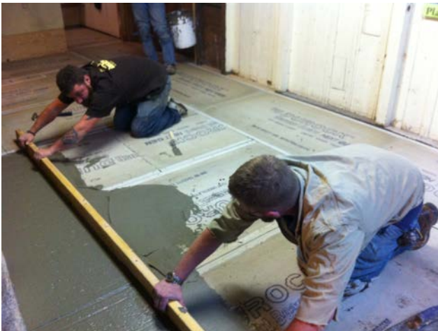
making the floor even