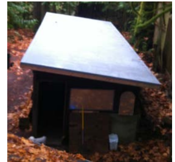
Harriet's new TPO roof